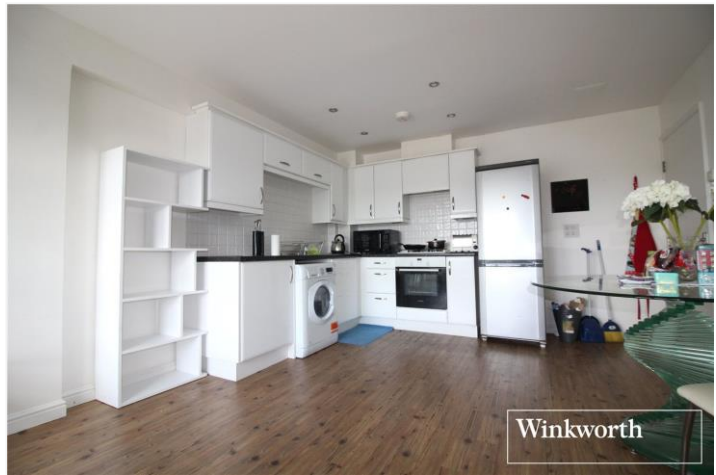
STATION ROAD, BOREHAMWOOD, HERTFORDSHIRE, WD6 £1,600 PER MONTH PART FURNISHED