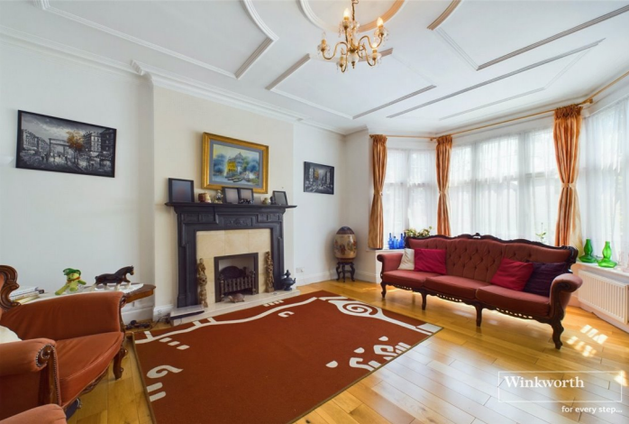
WHITCHURCH LANE, EDGWARE, MIDDLESEX, HA8 £950,000 FREEHOLD