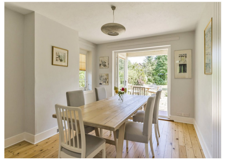
Morley Road, Surrey, GU9