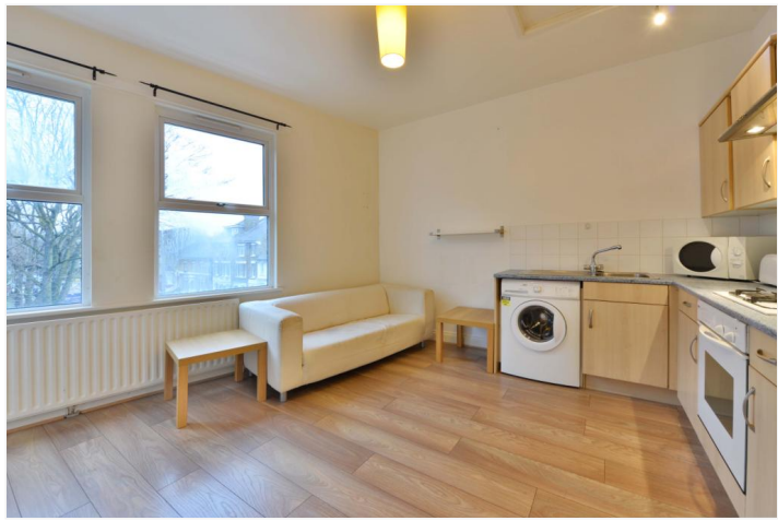
CLARENCE ROAD, E5 £1,192 PER MONTH FURNISHED, PART FURNISHED, UNFURNISHED