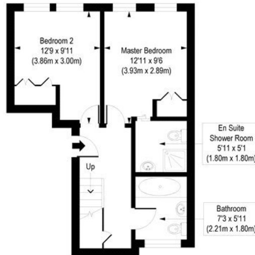
Ground Floor Gross Internal Floor Area 412 sq ft

COMPLIANT WITH RICS CODE OF MEASURING PRACTICE Floorplan is for illustrative purposes only and is not to scale. Every attempt has been made to ensure the accuracy of the floorplan shown, however all measurements, fixtures, fittings and data shown are an approximate interpretation for illustrative purposes only. Liability for errors, omissions or mis-statement through negligence or otherwise is hereby excluded.