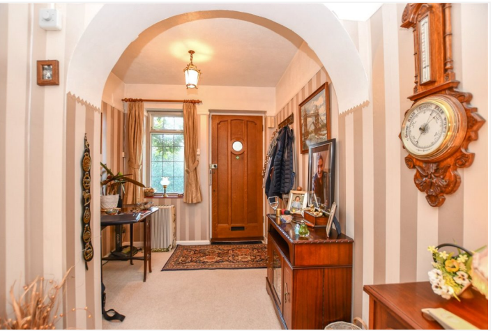
20 FROG HALL DRIVE, WOKINGHAM, BERKSHIRE, RG40 2LF £875,000 FREEHOLD

SITUATED ON ONE OF THE MOST SOUGHT-AFTER ROADS IN WOKINGHAM ON A PLOT OF APPROXIMATELY ¼ ACRE IS THIS EXTENDED THREE/FOUR BEDROOM DETACHED FAMILY HOME AND OFFERS FURTHER POTENTIAL FOR EXTENSION, SUBJECT TO THE USUAL CONSENTS.