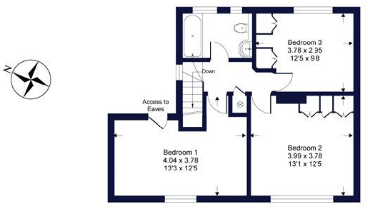
First Floor = 54.7 sqm / 589 sqft

Approximate Gross Internal Area = 139.4 sq m / 1501 sq ft Approximate Garage Internal Area = 11.9 sq m / 129 sq ft Approximate Total Internal Area = 151.3 sq m / 1630 sq ft