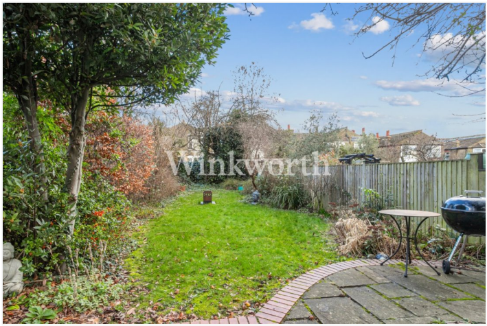
WINDSOR ROAD, N13 OFFERS OVER £725,000 FREEHOLD