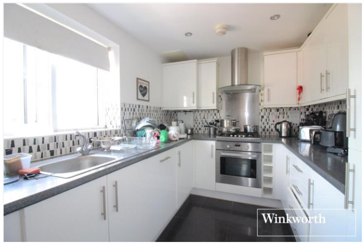
TAYLOR COURT, BOREHAMWOOD, HERTFORDSHIRE, WD6 £1,600 PER MONTH UNFURNISHED

A TWO BEDROOM TWO BATHROOM THIRD FLOOR FLAT IN THE SOUGHT AFTER OAKTREE DEVELOPMENT.