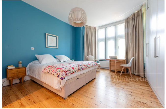
BRONDESBURY PARK, LONDON, NW6 OIEO £1,100,000 SHARE OF FREEHOLD

A STUNNING THREE DOUBLE BEDROOM, TWO BATHROOM, GROUND FLOOR APARTMENT WITH PRIVATE GARDEN IN STUNNING DETACHED BUILDING AND SUPERB LOCATION.