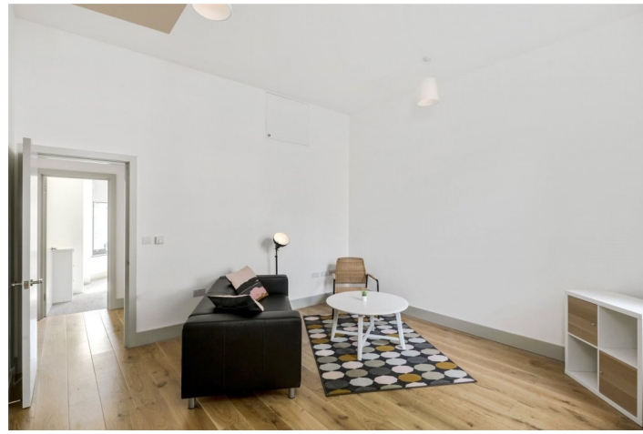
COVERDALE ROAD, LONDON, W12 £1,850 PER MONTH FURNISHED, PART FURNISHED £1,850 PER CALENDAR MONTH