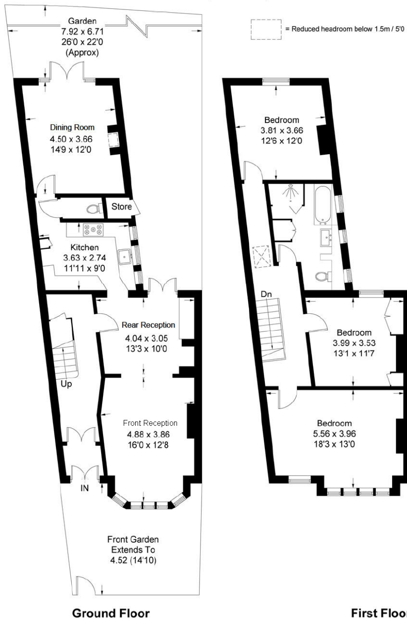
Illustration for identification purposes only, measurements are approximate, not to scale. (ID257293)

This floorplan is for illustration purposes only and is not to scale. The position and size of doors, windows, appliances and other features are approximate.