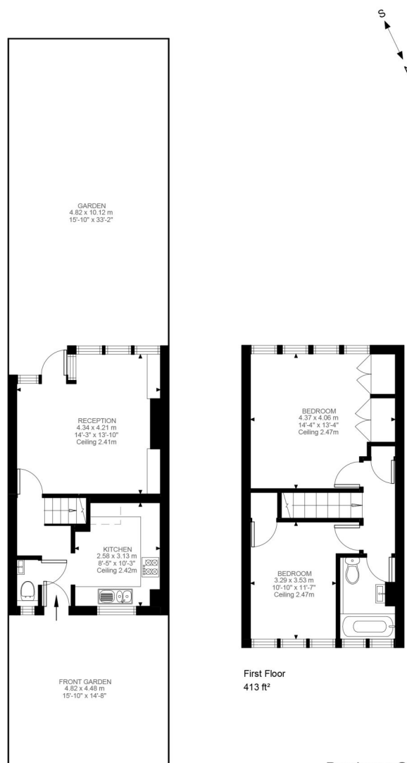
Ground Floor 345 ft 2