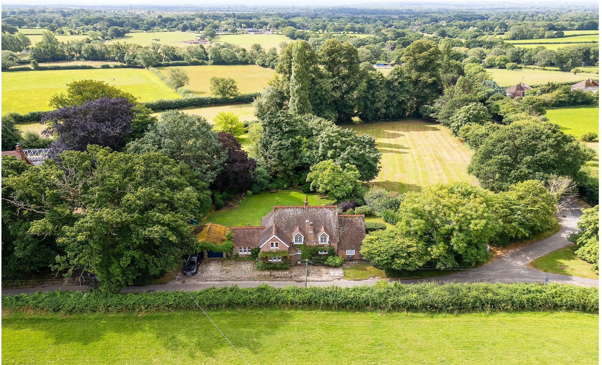
Pound Hill Cottage, Pound Lane, Plaitford, Romsey SO51 6EH