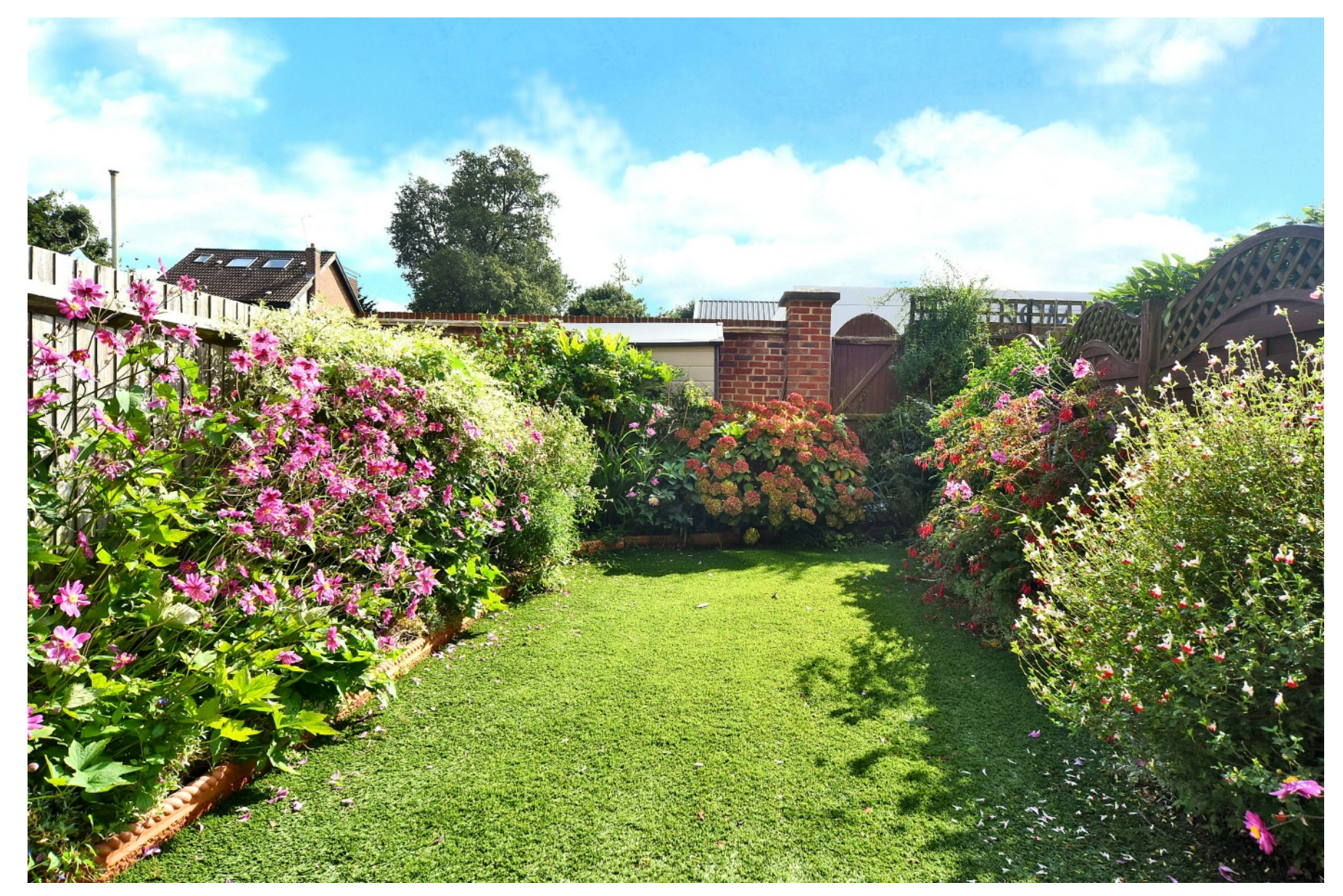
Under the Consumer Protection Regulations 2008, these Particulars are a guide and act as information only. All details are given in good faith and are believed to be correct at time of printing. Winkworth give no representation as to their accuracy and potential purchasers or tenants must satisfy themselves by inspection or otherwise as to their correctness. No employee of Winkworth has authority to make or give any representation or warranty in relation to this property.