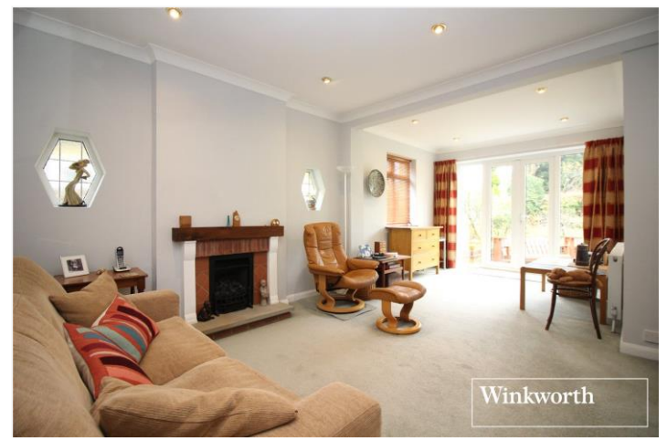
TENNISON AVENUE, HERTFORDSHIRE, WD6 £599,950 FREEHOLD