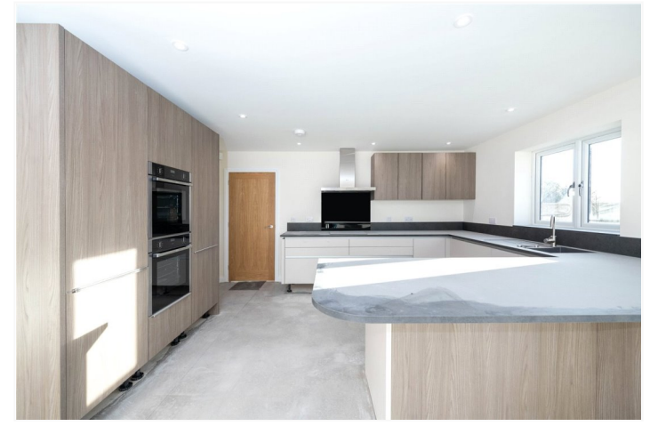
30c Main Street, Dorrington, Lincoln, Lincolnshire, LN4 3PX