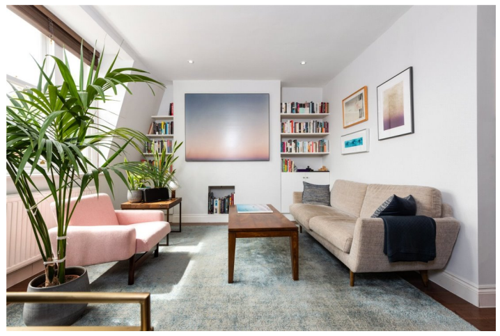
ASHFIELD STREET, LONDON, E1 £700,000 LEASEHOLD