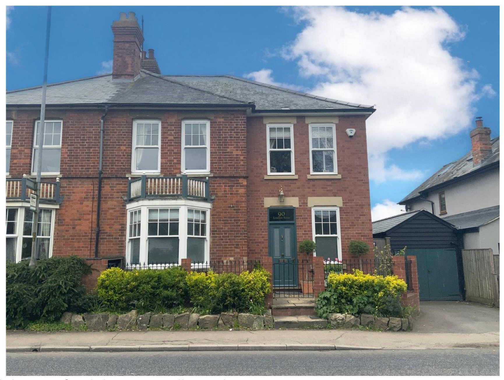
Beautiful character family home in Marlborough