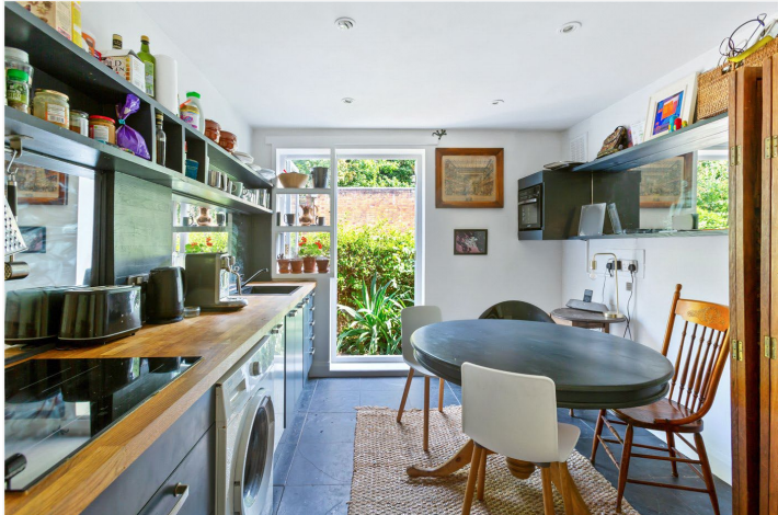
HAWARDEN GROVE, SE24 £625,000 LEASEHOLD