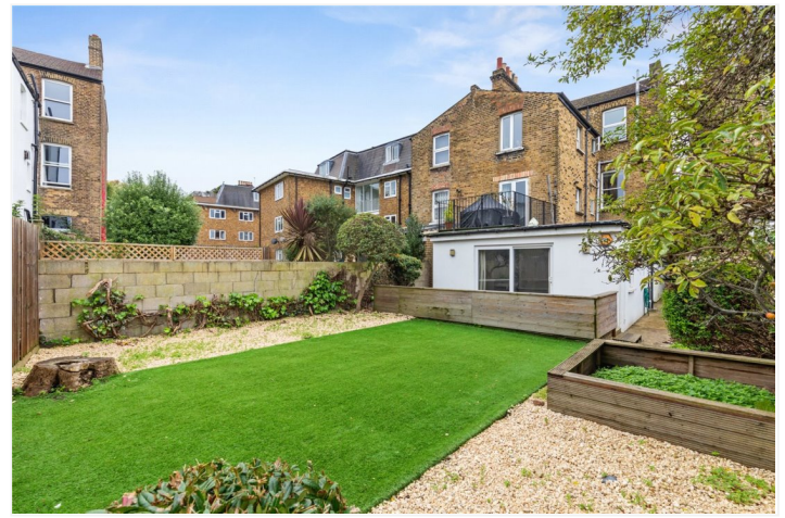
HERNE HILL ROAD, SE24 £675,000 SHARE OF FREEHOLD

VICTORIAN CHARMS MEETS CONTEMPORARY COMFORT IN THIS ELEGANTLY APPOINTED GROUND-FLOOR FLAT, IDEALLY LOCATED TO ENJOY THE BEST OF HERNE HILL