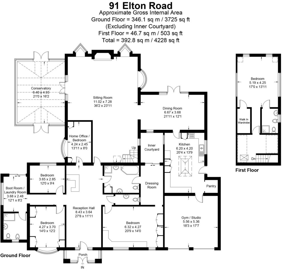
This plan is for layout guidance only. Not drawn to scale unless stated. Windows and door openings are approximate. Whilst every care is taken in the preparation of this plan, please check all dimensions, shapes and compass bearings before making any decisions reliant upon them.

Winkworth Bourne | 01778392807 | bourne@winkworth.co.uk winkworth.co.uk/bourne