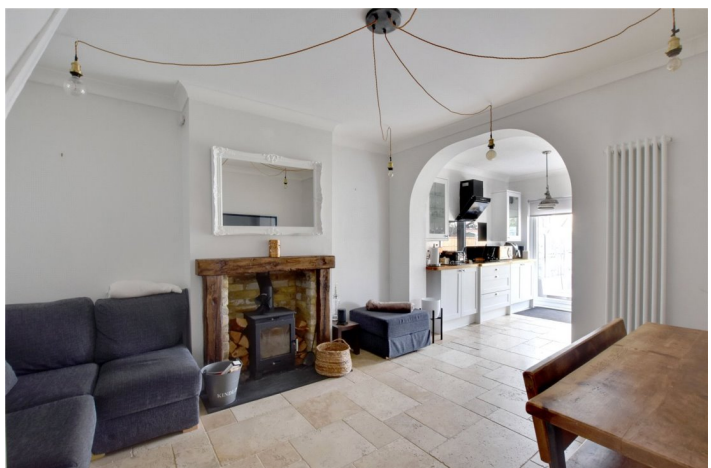
FALCONWOOD AVENUE, KENT, DA16 £2,700 PER MONTH UNFURNISHED