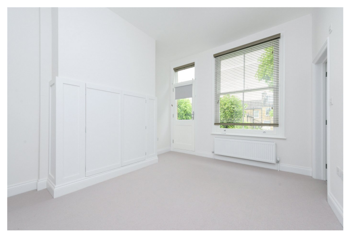
BRONDESBURY PARK MANSIONS, SALUSBURY ROAD, LONDON, NW6 £965,000 LEASEHOLD

A THREE BEDROOM, TWO BATHROOM, FIRST FLOOR FLAT IN A STUNNING PERIOD MANSION BUILDING BOASTING MODERN FINISHES AND SPACIOUS OPEN PLAN LIVING WITH DIRECT ACCESS TO COMMUNAL GARDENS.