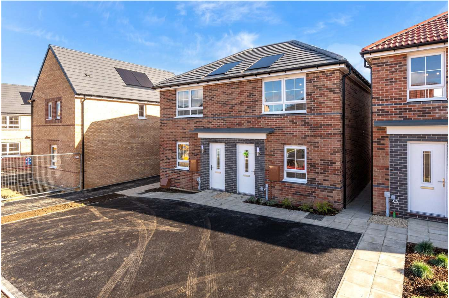
THE KENLEY, LEN PICK WAY, BOURNE. £207,995 FREEHOLD