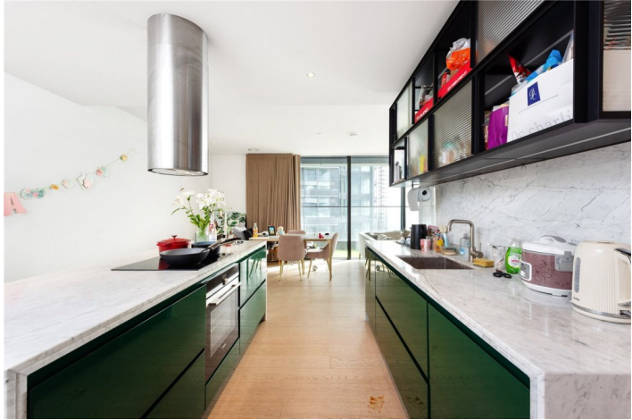
HOBART BUILDING, WARDS PLACE, LONDON, E14 £4,250 PER MONTH FURNISHED

AN EXQUISITE 1022 SQ/FT TWO BEDROOM APARTMENT ON THE 44TH FLOOR OF THE HOBART BUILDING, AN AWARD WINNING BALLYMORE DEVELOPMENT.