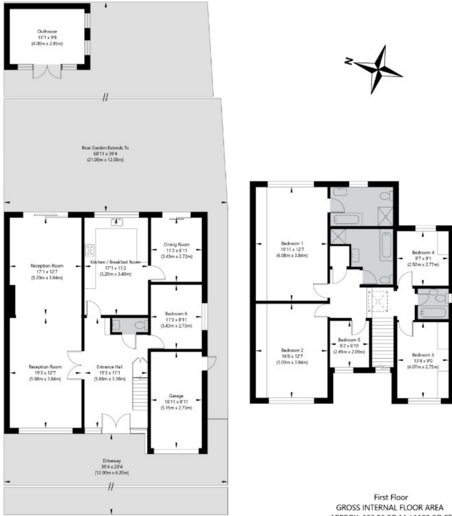
Ground Floor GROSS INTERNAL FLOOR AREA APPROX. 118.17 SQ M / 1272 SQ FT