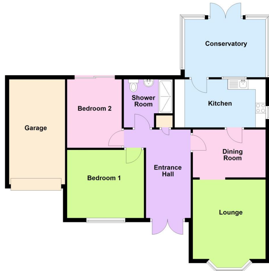
Total area: approx. 102.1 sq. metres (1099.4 sq. feet)