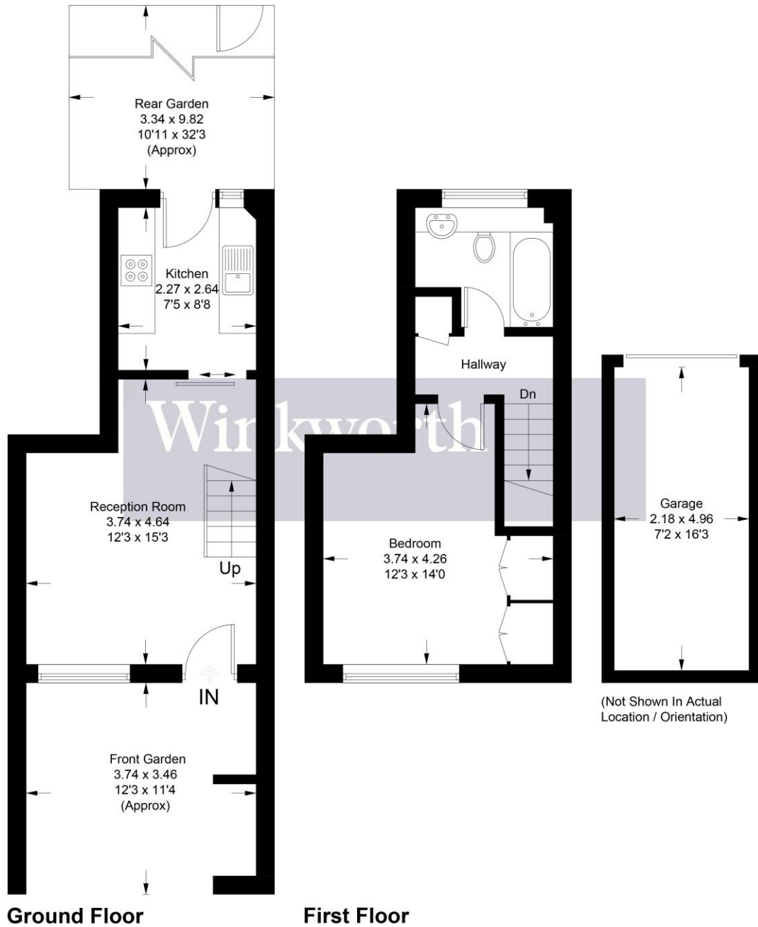
Illustration for identification purposes only, measurements are approximate, not to scale. Winkworth © 2024 (ID1086305)

Approximate Gross Internal Area = 44.1 sq m / 475 sq ft Garage = 10.9 sq m / 117 sq ft Total = 55.0 sq m / 592 sq ft