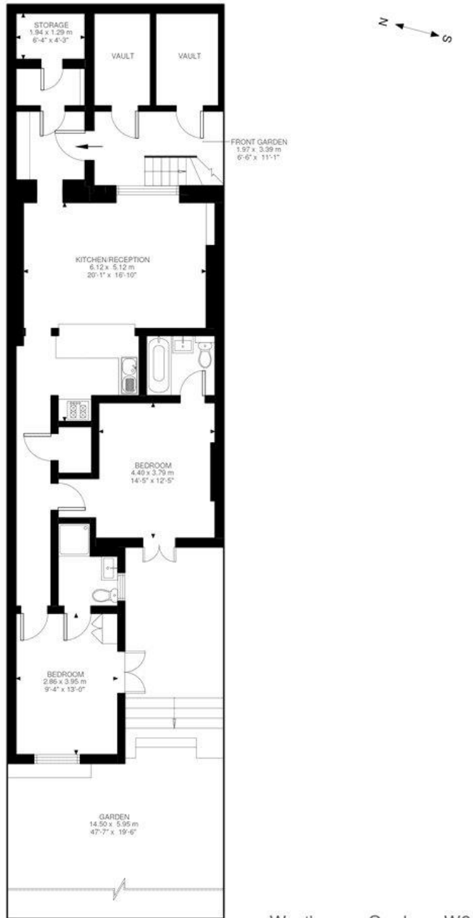
Lower Ground Floor 863 ft 2