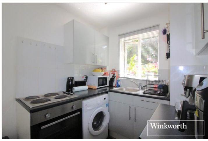
WEBBER CLOSE, ELSTREE, HERTFORDSHIRE, WD6 £1,495 PER MONTH UNFURNISHED