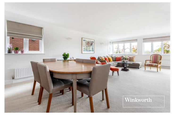
HENDON LANE, LONDON, N3 £900,000 SHARE OF FREEHOLD