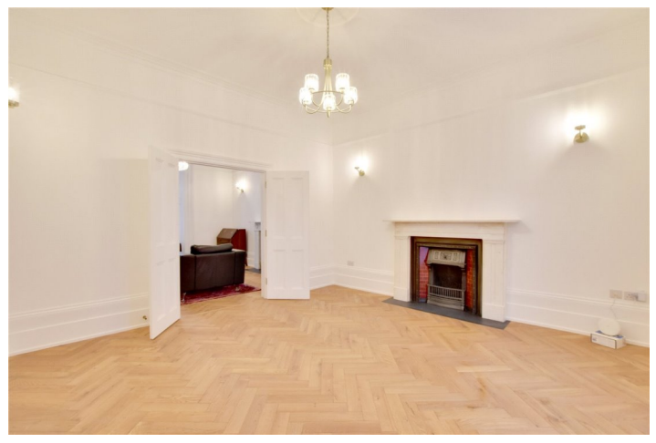
BELMONT HILL, SE13 £7,000 PER MONTH UNFURNISHED