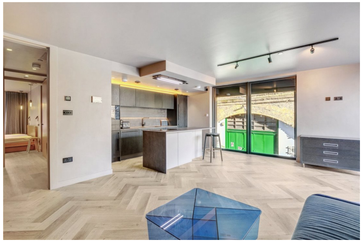
CREMER STREET, LONDON, E2 £840,000 LEASEHOLD