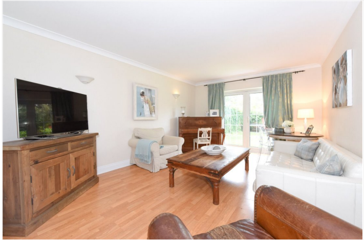
BROOKLANDS ROAD, WEYBRIDGE, KT13 £3,600 PER MONTH UNFURNISHED