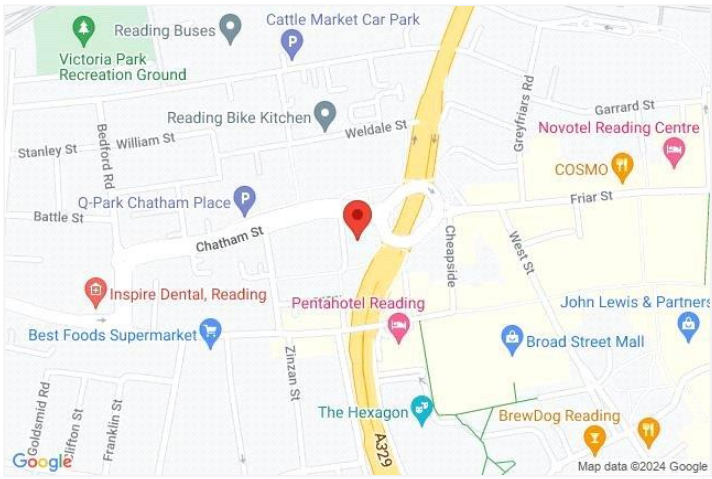
HEWITT, ALFRED STREET, BERKSHIRE, RG1 7LS GUIDE PRICE £250,000 LEASEHOLD