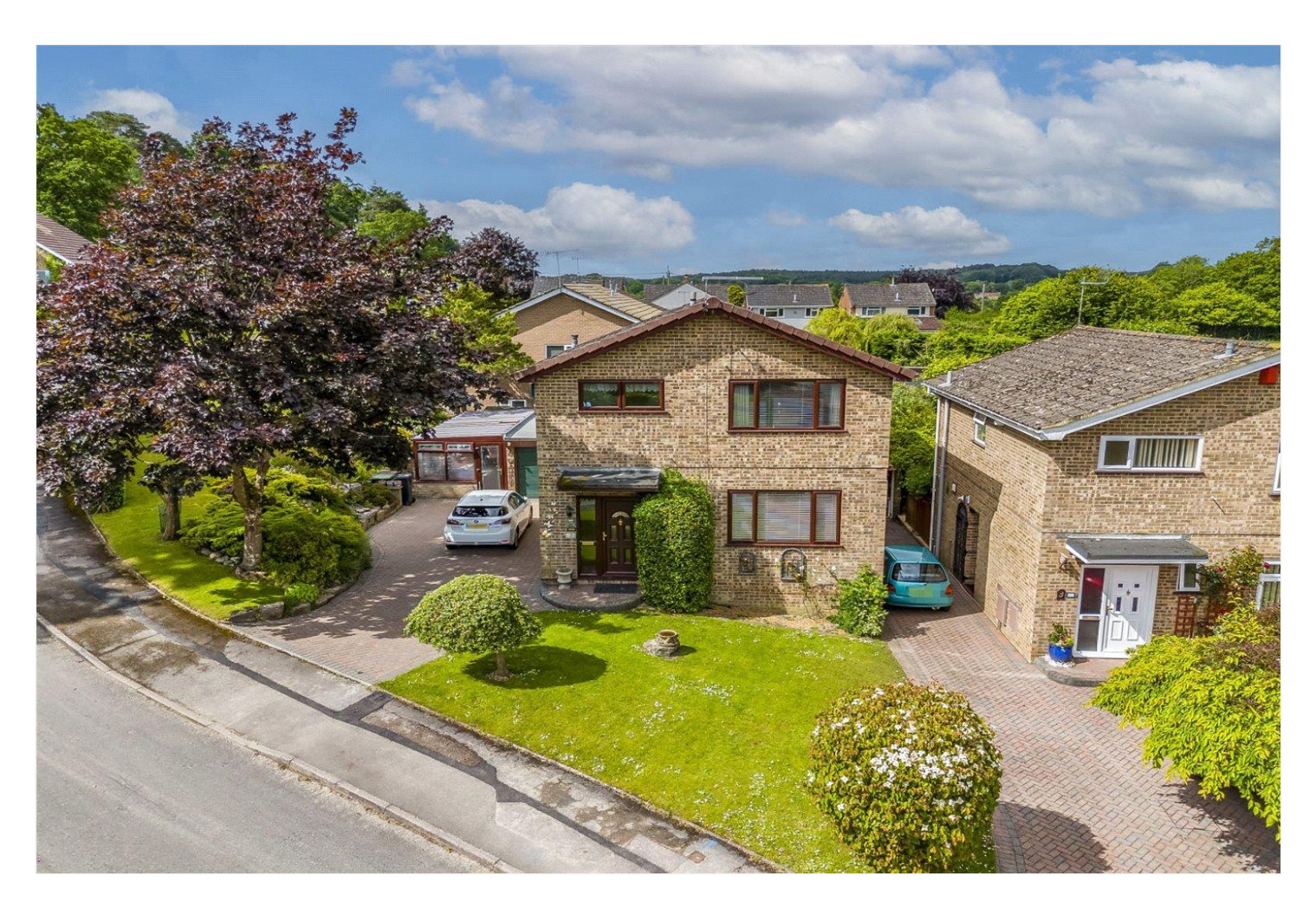
7 ORCHARD LANE, CORFE MULLEN, WIMBORNE, DORSET, BH21 3SU £510,000 FREEHOLD