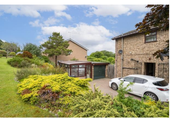
This floorplan is for illustration purposes only and is not to scale. The position and size of doors, windows, appliances and other features are approximate.