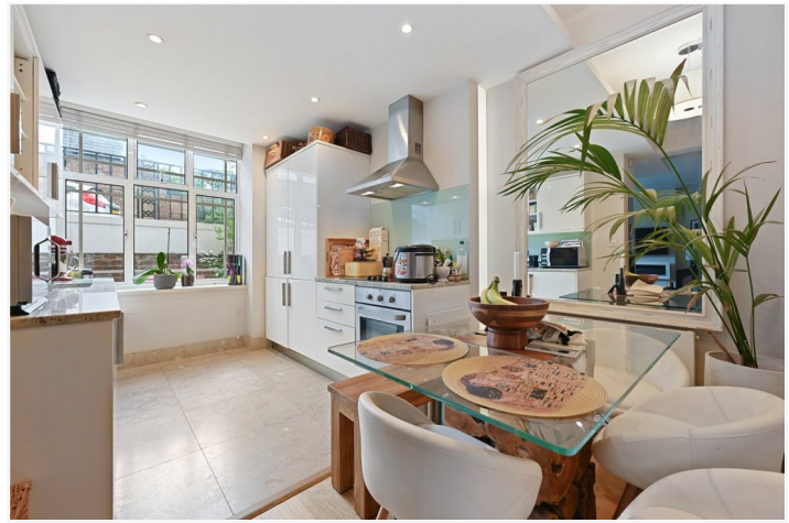
EDWARDES SQUARE, W8 £825,000 LEASEHOLD

A LARGE AND VERY WELL-PRESENTED SOUTH FACING APARTMENT SITUATED ON THE LOWER GROUND FLOOR OF THE WELL MAINTAINED PORTERED MANSION BLOCK.