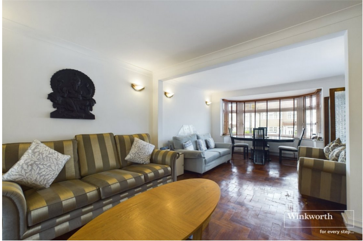
ST. AUSTELL CLOSE, EDGWARE, MIDDLESEX, HA8 £565,000 FREEHOLD