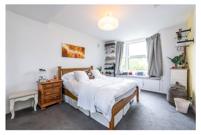
STANLEY GARDENS, LONDON, NW2 £575,000 LEASEHOLD

A WELL-PRESENTED TWO DOUBLE BEDROOM, FIRST FLOOR FLAT IN A PERIOD CONVERSION, IDEALLY LOCATED FOR TRANSPORT LINKS AND AMENITIES OF WILLESDEN GREEN.