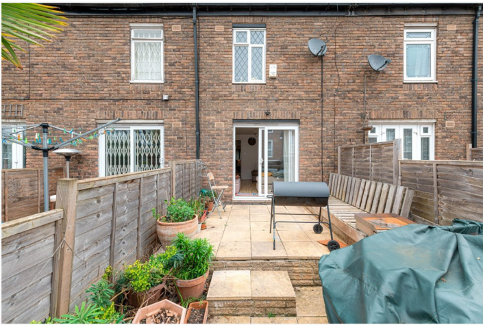
NOTTING BARN ROAD, W10 £700,000 FREEHOLD