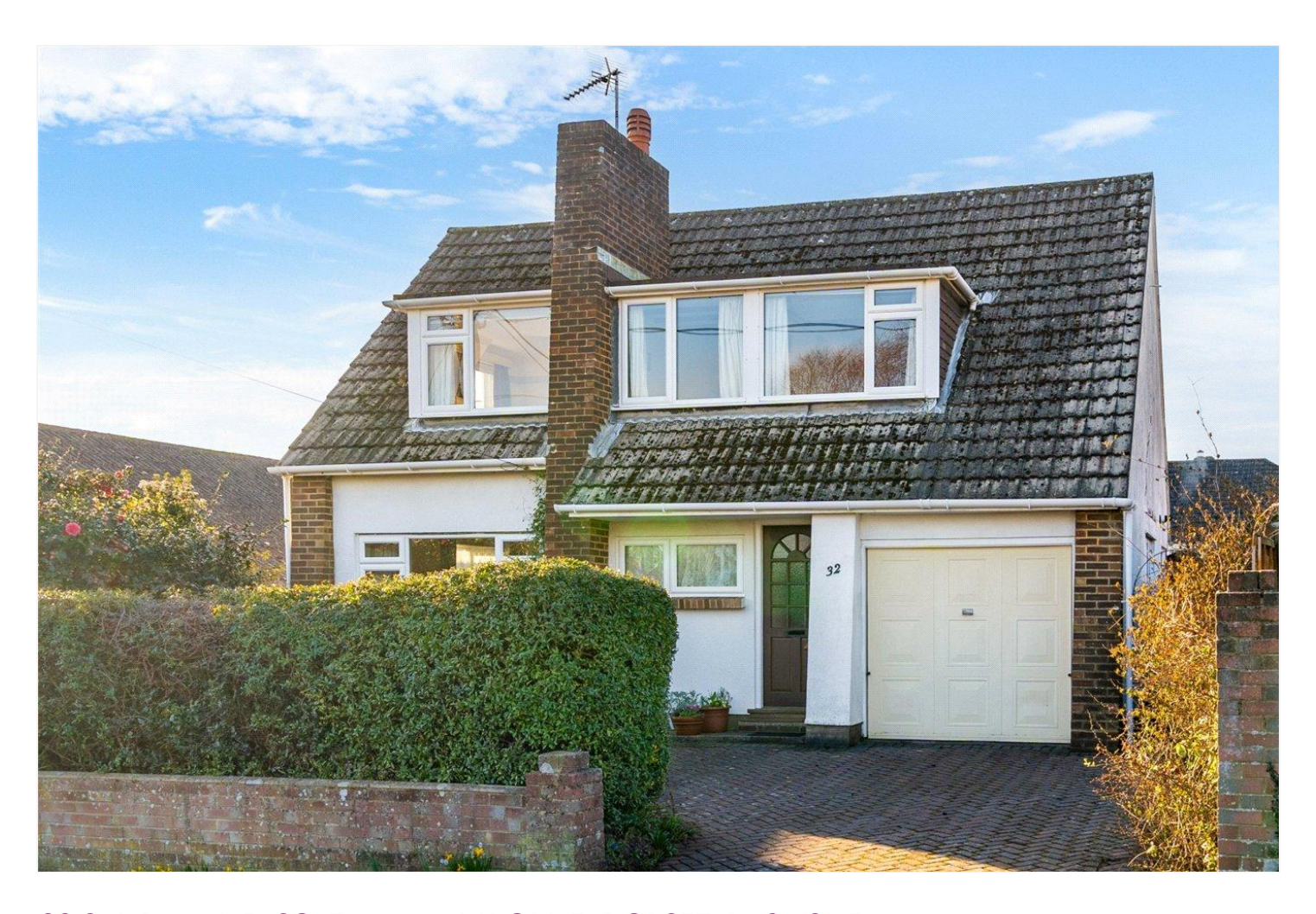
32 SANDY LANE, COLEHILL, WIMBORNE, DORSET, BH21 2NF £450,000 FREEHOLD