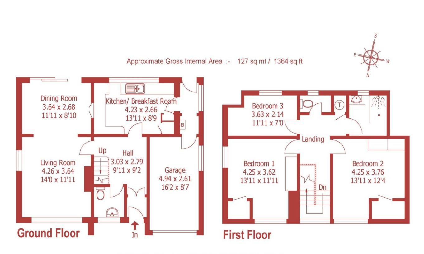
For identification purposes only, not to scale, do not scale