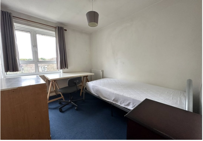
The Chantrys, Surrey, GU9