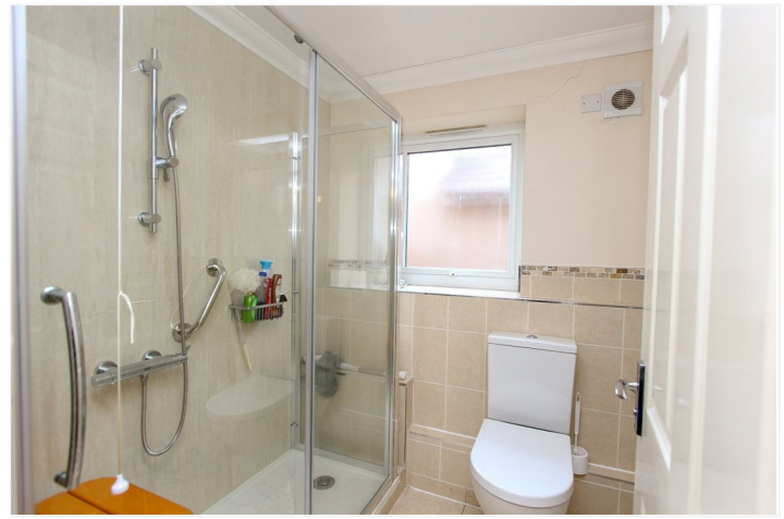
SHAKESPEARE AVENUE, WESTCLIFF ON SEA £300,000 LEASEHOLD