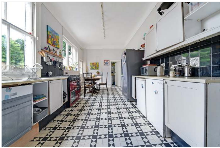
UNDERHILL ROAD, EAST DULWICH, LONDON, SE22 OIEO £1,450,000 FREEHOLD