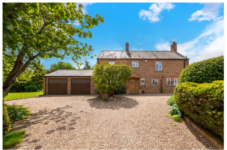
Elm Farm, Spanby, Sleaford, Lincolnshire, NG34 0BB £650,000 Freehold

Sitting in Approximately 2/3 of an Acre | Beautifully Appointed Detached Home | Views Over Open Fields | Mature Gardens | Well Proportioned Rooms | Rural Location | Ample Parking | Stunning Garden Room | Flexible Accommodation | South Facing Rear Garden