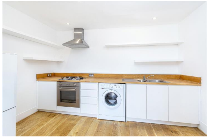
ELGIN CRESCENT, LONDON, W11 £695 PER WEEK (£3,011.66 PCM) UNFURNISHED

A BEAUTIFUL NEWLY REFURBISHED 2-BEDROOM TOP FLOOR FLAT IN AN ATTRACTIVE PERIOD BUILDING OVERLOOKING COMMUNAL GARDENS AND CLOSE TO THE BUZZ OF PORTOBELLO ROAD.