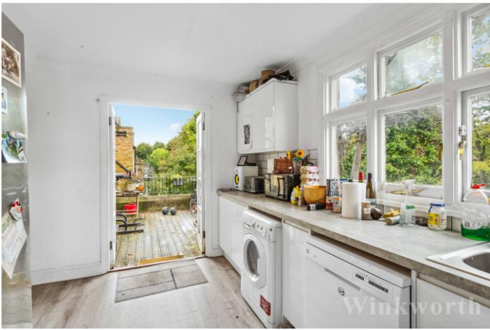
MILDMAY GROVE NORTH, LONDON, N1 £875,000 LEASEHOLD