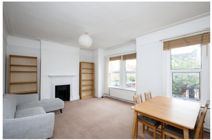
STUART ROAD, LONDON, W3