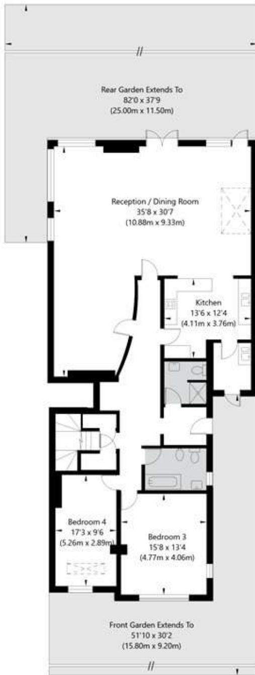
Ground Floor GROSS INTERNAL FLOOR AREA APPROX. 171.57 SQ M / 1847 SQ FT