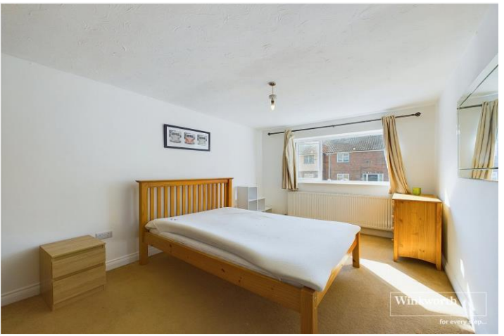
WESTBOURNE TERRACE, BERKSHIRE, RG30 OFFERS IN EXCESS OF £500,000 FREEHOLD